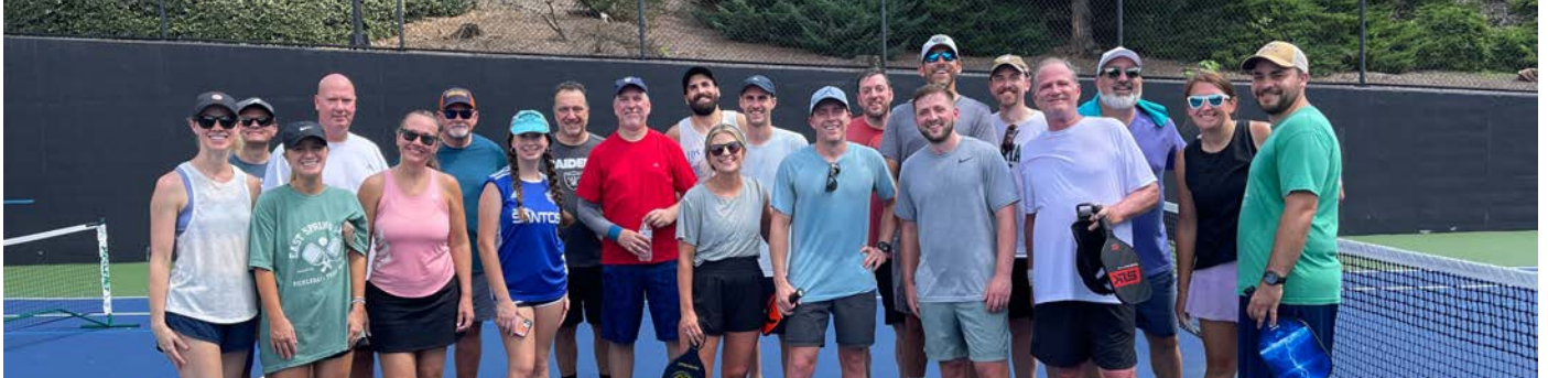
ESL Pickleball Tournament players